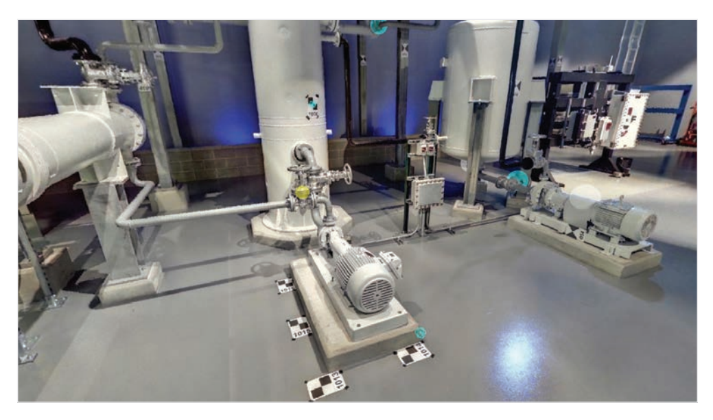
The Viewer functionality provides a window into your point cloud data. The BubbleView gives you like a bird's-eye view in which 3D data can be measured and intelligence added to it.