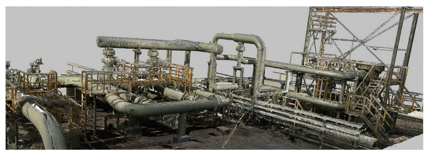
Solid point cloud visualization technology gives you a clear view of massive datasets